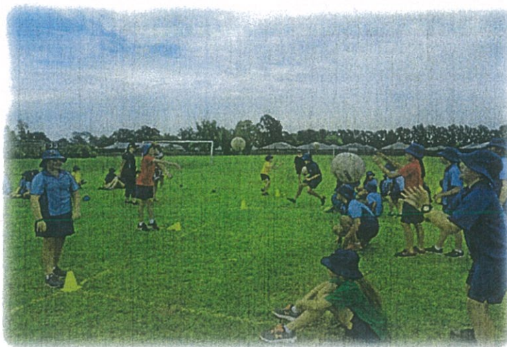
2018 Ball Games Carnival

Providing Quality Education in a Caring Environment Since 1876