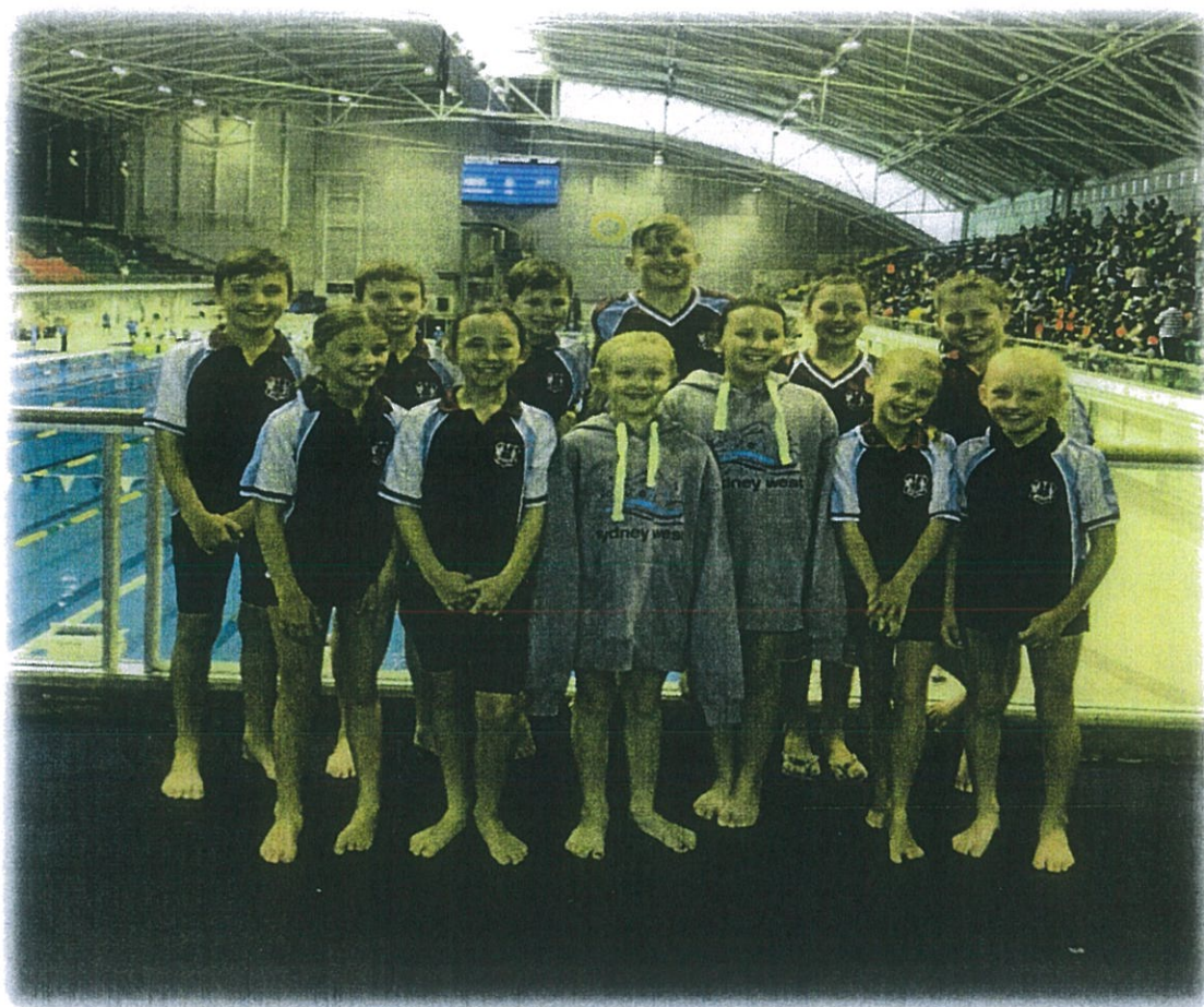
Well Done – Sydney West Swim Team

The fortnightly newsletter of Pitt Town Public School